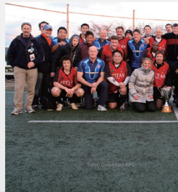
Tokyo Crusaders RFC

The Cru kicked off to begin the 1st half and we were introduced to how physical this game was going to be. It was all forwards for the first part of the game going back and forth