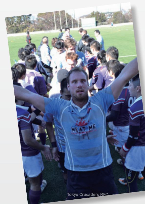
Tokyo Crusaders RFC